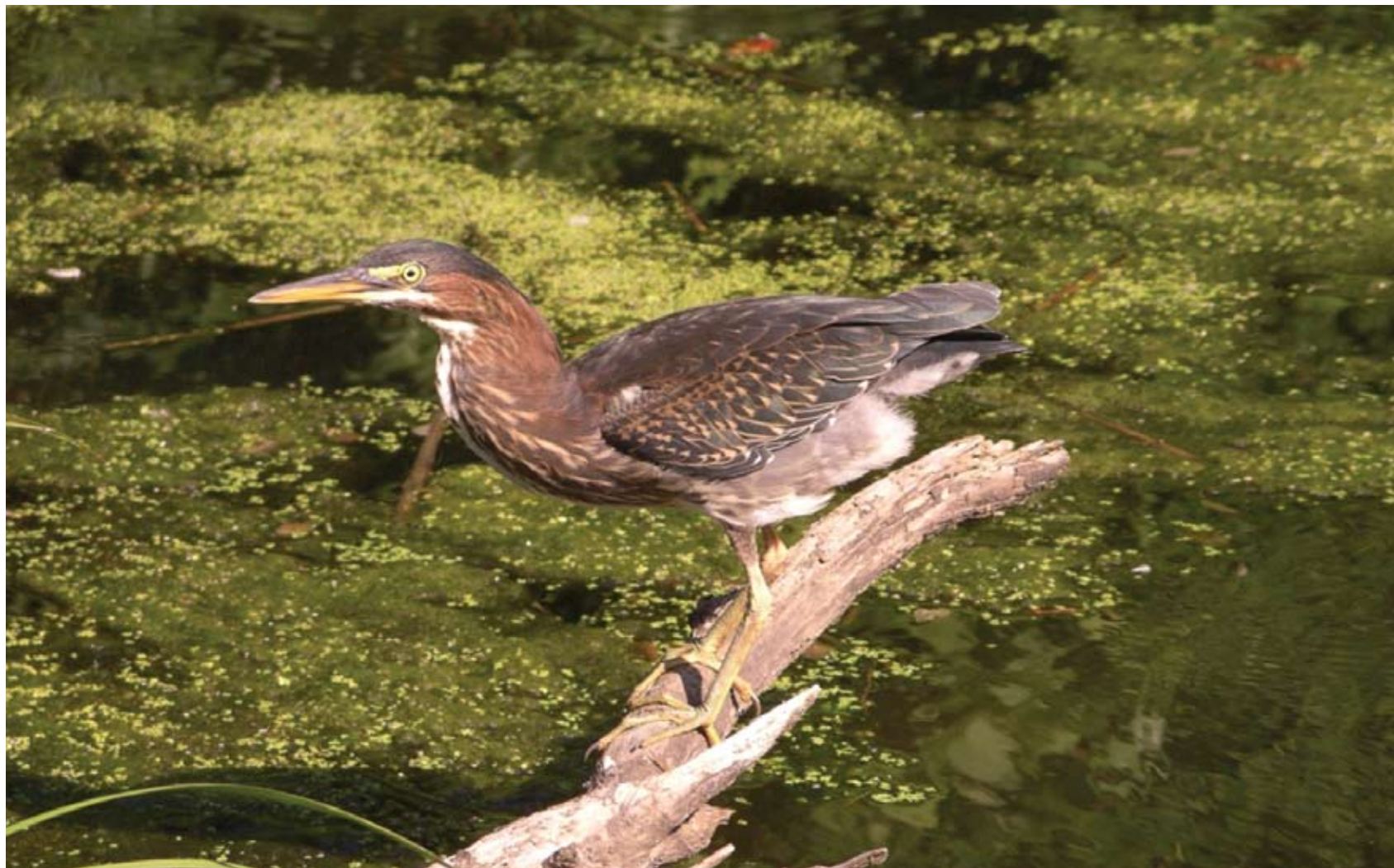
Fig. 3 Green heron ( Butorides virescens ) observed preying tadpoles in an agricultural wetland.